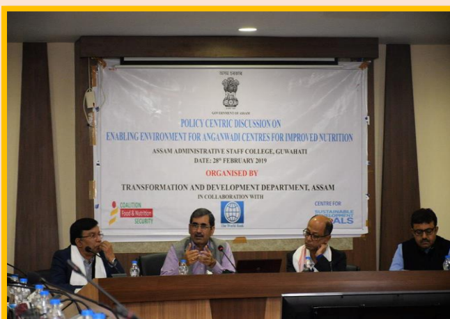
Policy centric discussion on enabling environment for Anganwadi centres for improved nutrition