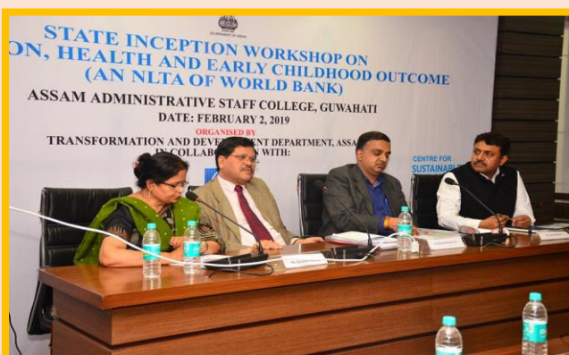
State Inception Workshop on Nutrition, Health and Early Childhood Development, Guwahati to accelerate Sustainable Development Goals.