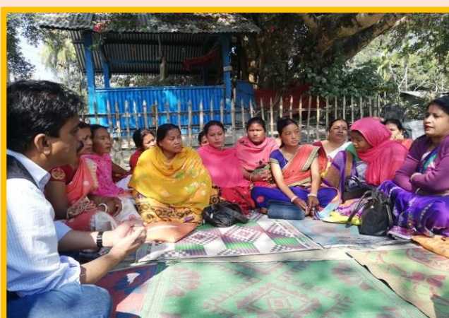
Focus Group Discussion in Goalpara district of Assam on maternal and child malnutrition