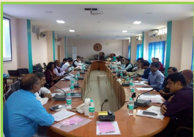
Stakeholders consultation to Accelerate SDGs by achieving Nutrition Outcomes in Goalpara district of Assam