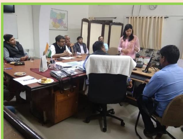
Stakeholders Consultation in Tonk (Rajasthan) on Nutrition Outcomes based on the KAP study,